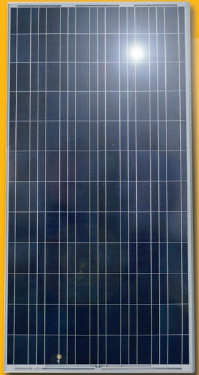
Polycrystalline module (detailed view)