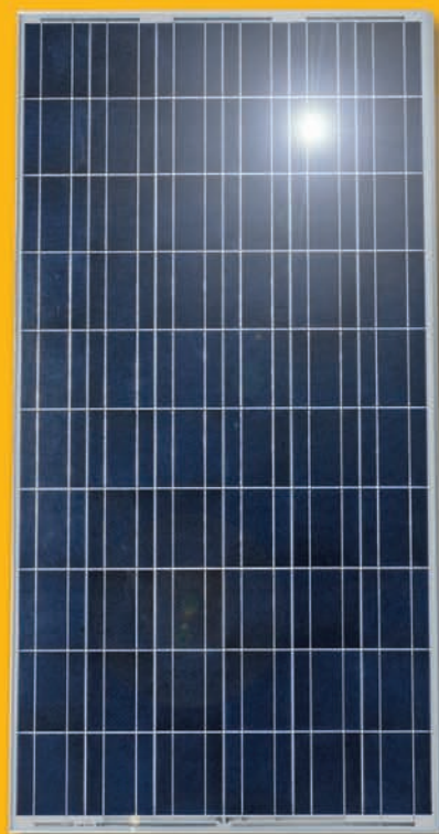
Polycrystalline module (detailed view)