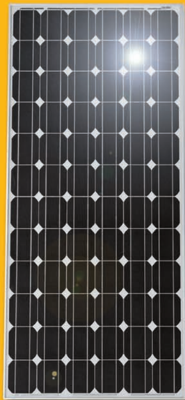
Monocrystalline module (detail view)